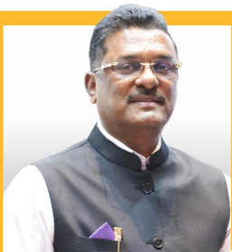
Shri. Pratap Sarnaik , Honourable Minister of Transport, Government of Maharashtra, underlined the state's infrastructure push at TLI

"Maharashtra is seeing a major shift in its logistics landscape through focused investments in infrastructure and connectivity. Projects such as Vadhavan Port, Mumbai's proposed third airport, and corridors like the Samruddhi Expressway and Atal Setu are set to improve efficiency and lower logistics costs for industry. The state is also working towards more integrated logistics hubs to simplify transport and operations. These initiatives aim to attract greater investment and create employment opportunities for local youth. Maharashtra remains committed to supporting business growth and strengthening its position as a leading industrial and logistics hub."